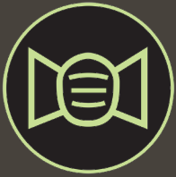
Mask Fit & Go*

Activates the display upon waving in front of the screen