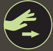
Wave & Go

Starts treatment automatically upon breathing in the mask