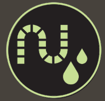
Adaptive Thermo Control

Reacts to all respiratory events, including flow limitations and snoring